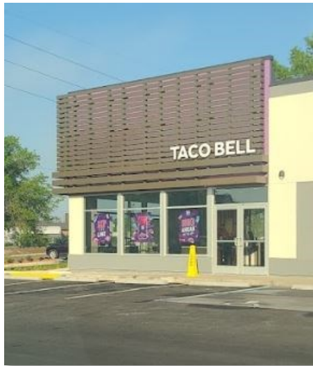
Slat Wall Side and Front Panel Detail